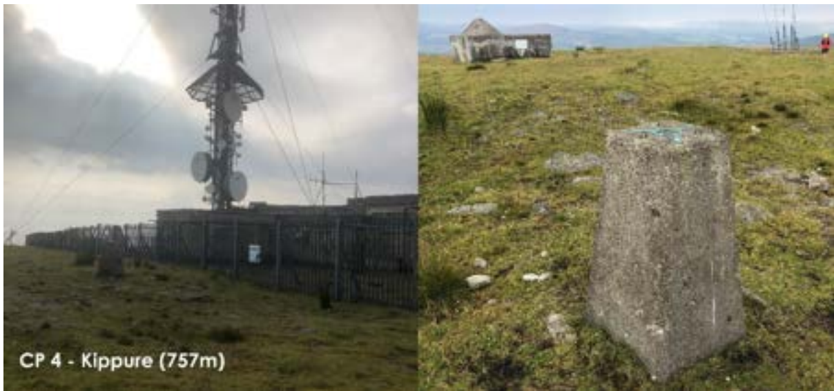
CP 4 - Kippure (757m)