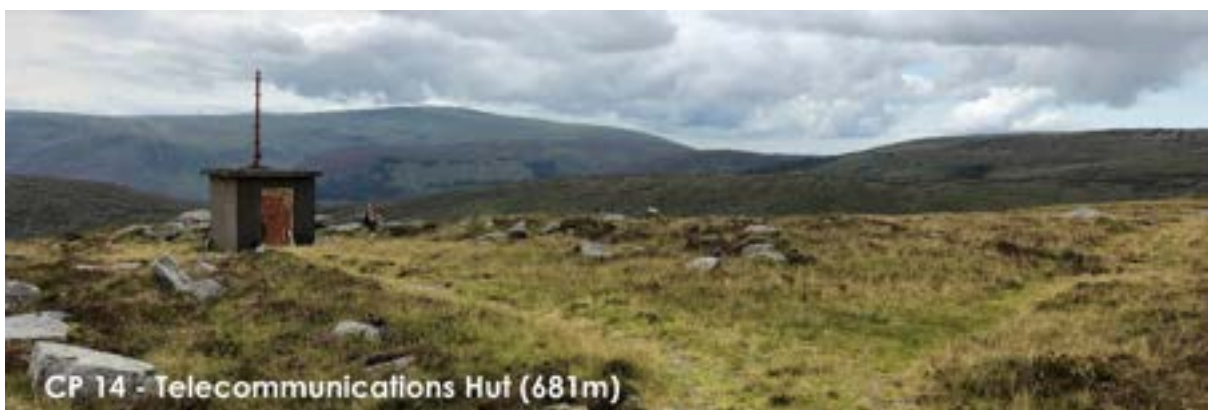
CP 14 – Communications Hut (681m) (Grid Ref: T-063,983)