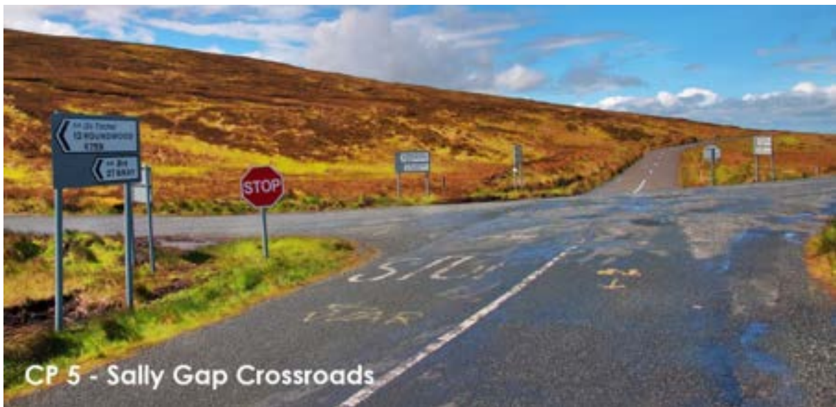
CP 5 - Sally Gap Crossroads